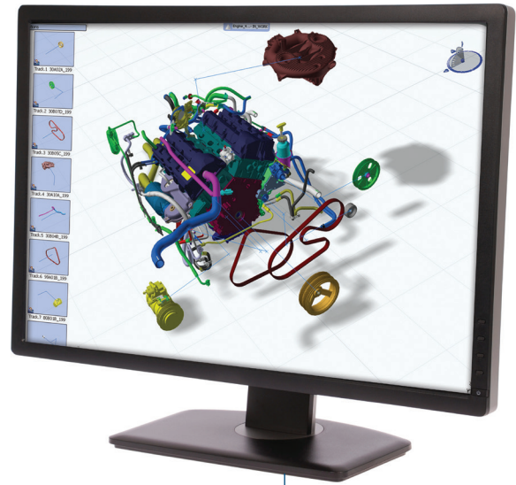
Perform assembly feasibility studies with the 3DEXPERIENCE platform

The assembly process can be created and validated in the context of the shop floor environment with a clear understanding of how it may impact the assembly plan.