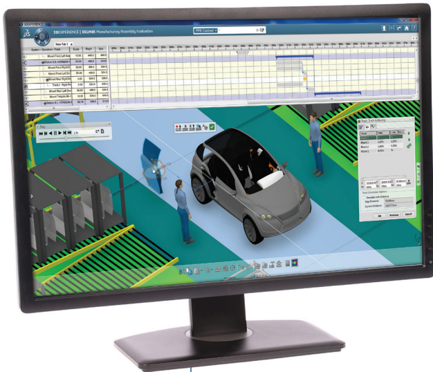
Tools that accelerate and streamline assembly planning and simulation